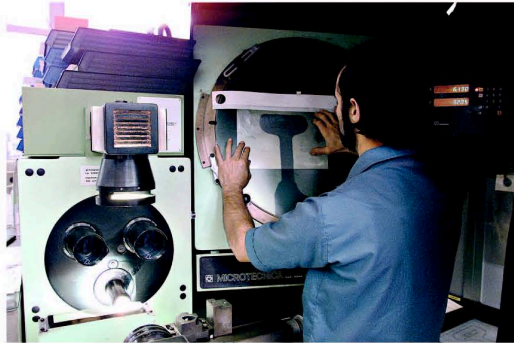
CAREFUL CHECKING OF RING PROFILE