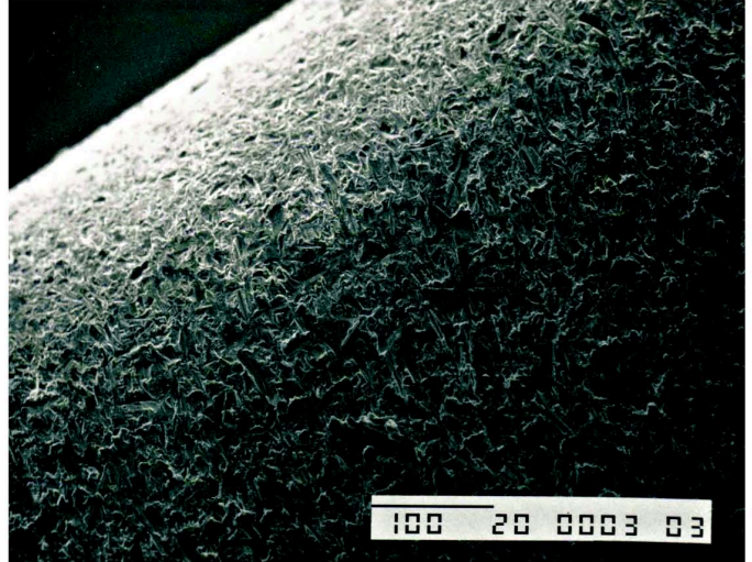
RZD PROTECTED SURFACE x 200 MAGNIFICATION AT SEM MICROSCOPE

25.000.000 rings sold so far are the proof of the strong reliability of RZD PROTECTED rings. Our black colour rings are known all over the world for their excellent quality/price ratio, their availability for any brand of spinning frames, their high technical content and their smooth, micro-porous and silky surface able to catch the natural lubrication of the fiber spun.