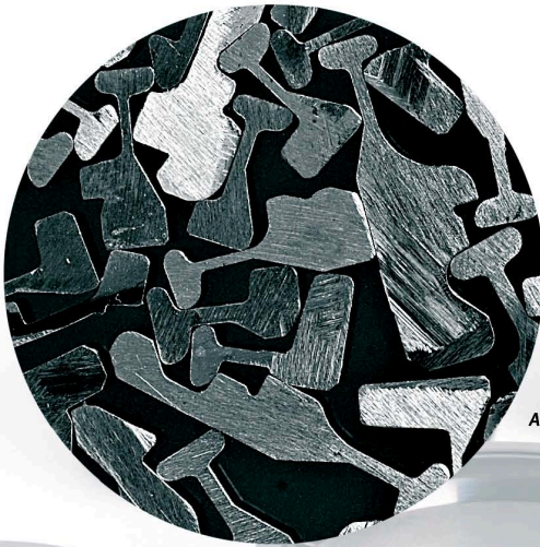
AVAILABILITY OF ANY RING PROFILE