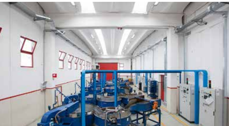
Special in house Double Anhealing and Subfreezing Heat Treatment