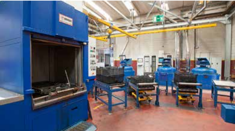
Heat treatment operation

Titanium carbides are elements that can be found less likely. These elements are characterized by very high hardness and for this reason, during the whole manufacturing process they do not change their roundish shape. These carbides could lead to problems during machining, like very high degree of tools change and if found on the bearing track they can damage rolling elements like balls and rollers